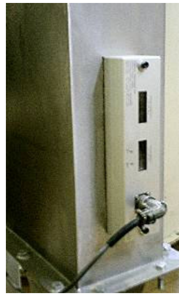
Moisture Sensing Unit

The Satake Automatic Moisture Control System SMWC is a reliable and cost effective way of controlling the addition of water to wheat during the tempering process. Using modular components, it is straightforward to install a fully integrated feedback control system in your own wheat mill.