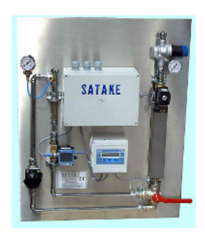
SWEC Water Control Panel