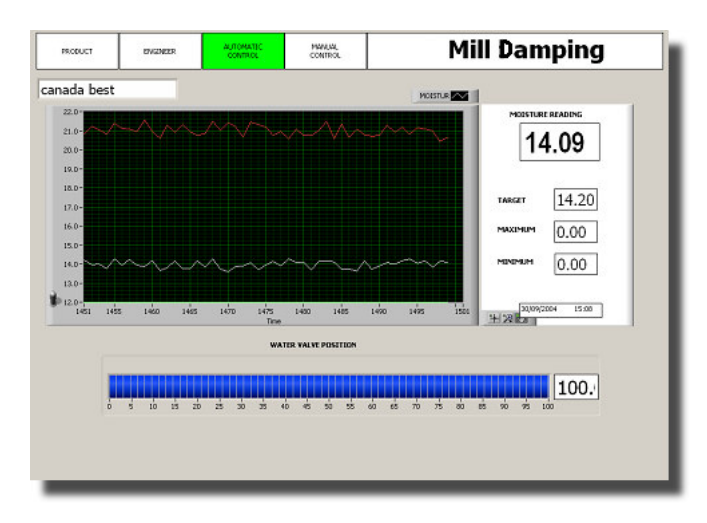
Software Interface 'MoistureOne'