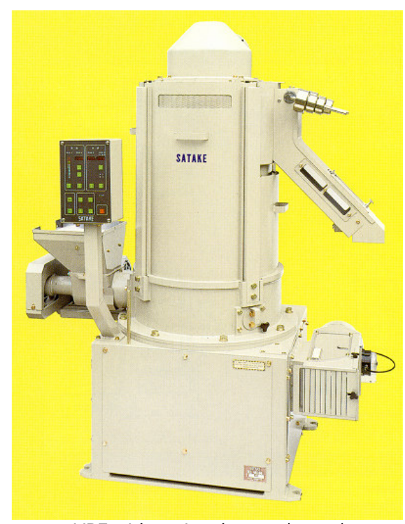
VBF with optional control panel

The new Satake VBF series of vertical maize (corn) degerming machines incorporate the most advanced techniques and has proved to be superior to other machines in maize degerming mills throughout the world. The versatility of the VBF for decorticating and degerming of all kernels makes it the ideal machine for modern maize mills.