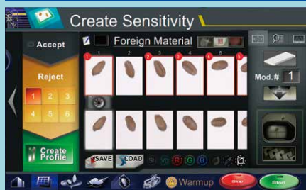
Automatic Sensitivity Creation