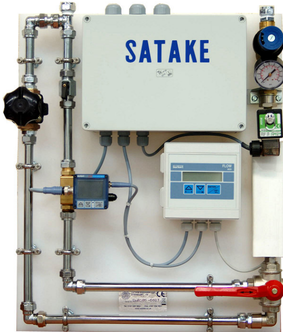
SWEC Panel with Litres/min Controller

The SWEC Water Panel controls and monitors the flow rate of water using all electronic components. The main use is in the addition of water to wheat and other cereal grains before milling.