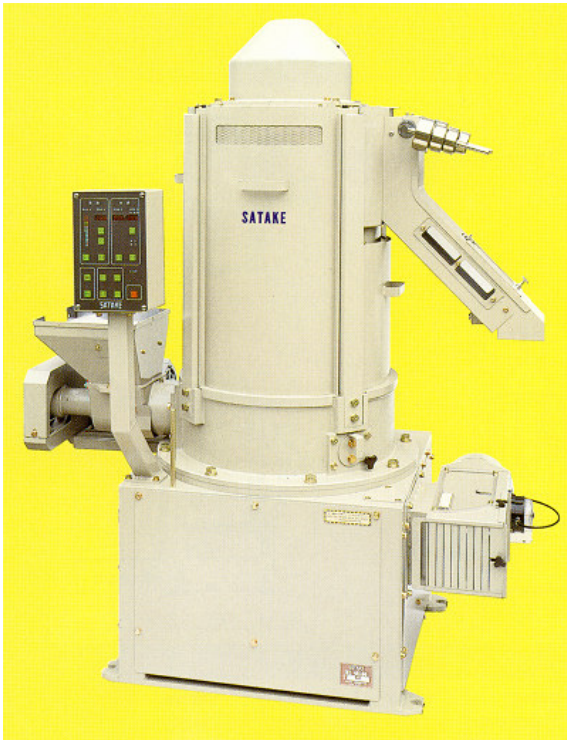
VBF with optional control panel

The new Satake VBF series of vertical maize (corn) degerming machines incorporate the most advanced techniques and has proved to be superior to other machines in maize degerming mills throughout the world. The versatility of the VBF for decorticating and degerming of all kernels makes it the ideal machine for modern maize mills.